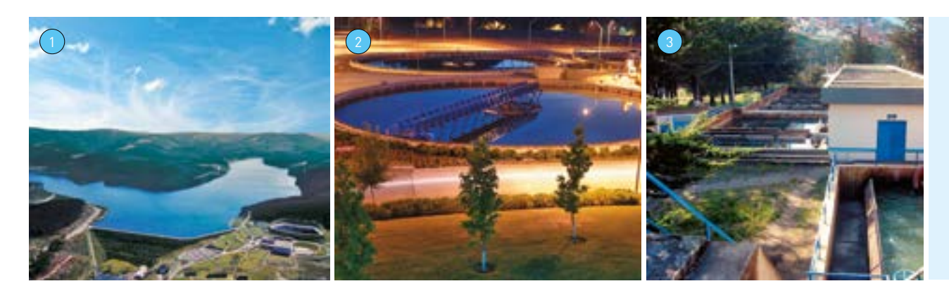
They all provide a reliable water supply: the Granetal reservoir in Germany [1], the waterworks La Florida in Santiago de Chile [2] and the water treatment plant Planta Achachicala in La Paz [3].