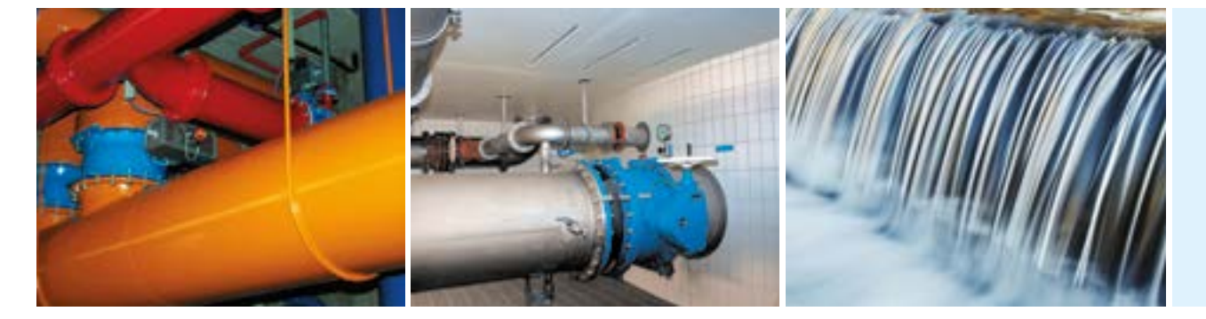
The extraction and transportation of drinking water, our most important commodity, place special requirements on the quality of valves.